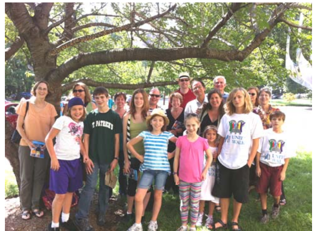
Above: Redeemer parishioners at the Unity Walk; Below: Interfaith youth service group prior to the Walk.