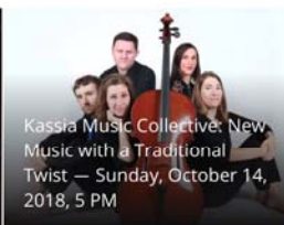
Kassia Music Collective: New Music with a Traditional Twist — Sunday, October 14, 2018, 5 PM