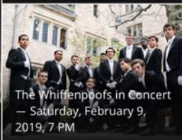
The Whiffenpoofs in Concert — Saturday, February 9, 2019, 7 PM