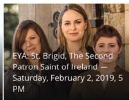
EYA: St. Brigid, The Second Patron Saint of Ireland — Saturday, February 2, 2019, 5 PM